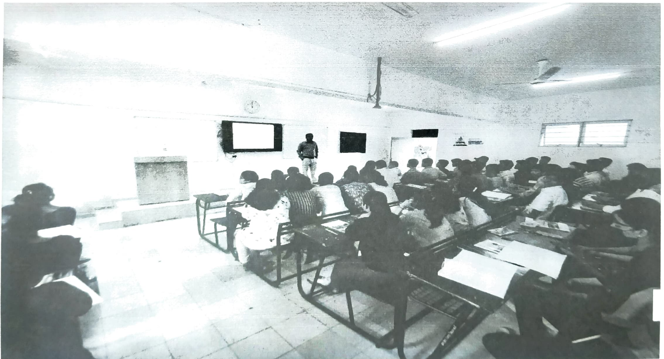
Figure 2: Theory session by the resource person