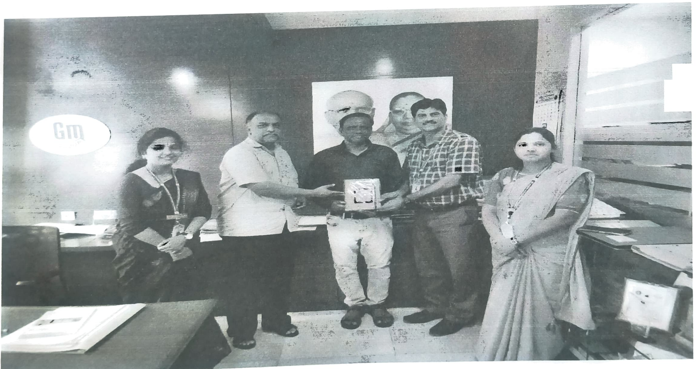
Figure 4: Felicitation to the Resource person