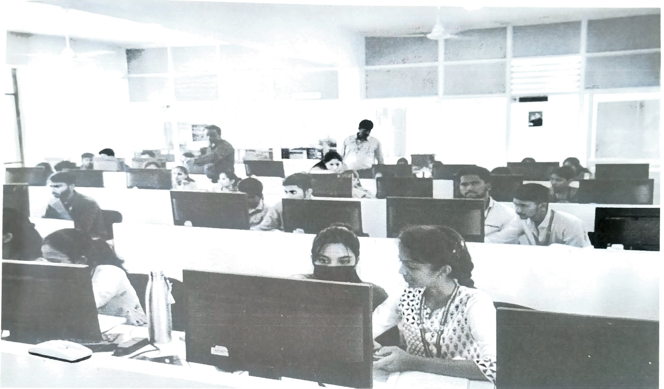
Figure 1: Hands –on Session on Cadence Tool